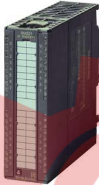
SIMATIC S7-300, Digital input SM 321, Isolated 16 DI, 24 V DC, Source input, 1x 20-pole