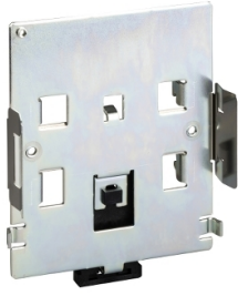
plate for mounting on symmetrical DIN rail, Altivar, for variable speed drive, size 2C and 2F